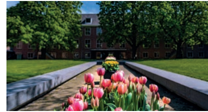
Planters with lily-flowered tulips greet visitors on their way to the museum entrance: the orange-yellow "Fire Wings", the yellow "Flashback", the purple with white "Claudia" and the orange with salmon pink flame "Request".