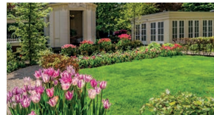
At the entrance, wooden tubs are home to the "Lady Waldorf Astoria", christened last year, an elegant white tulip with large pink-red flames, resembling a historic variety. This tulip, unique to Waldorf Astoria Amsterdam, also grows in wooden tubs in the historic courtyard garden in front of the Tea House. In addition, there are several other varieties of tulips in wooden tubs on the terrace, all of which are fringed: the red with white fringes "New Santa", the double apricot-coloured "Brisbane", the yellow with red "Party Clown", the double pink with white "Queensland", the purple tulip with white base "Purple Chrystal", the double lilac "Newcastle", the pink-orange "Louvre Orange" and the red "Calibra". On the edge of the roof is the yellow-purple

flamed tulip "Helmar". Various varieties have been planted in the ground: in the oval, "Lady Waldorf Astoria", next to it "American Dream", a soft yellow to red-orange fading tulip, against the building a border of pink and white "Meryl", a double pink "Marriage" and a white and green tulip "Spring Green". The square tree pits feature "Cape Cod", orange with yellow. The rose beds feature the fringed lilac with white "Purple Circus" and the borders contain mixed tulips, including the orange "Orange Emperor", the purple with white "Rem's Favourite" and the orange-yellow "World's Favorite".