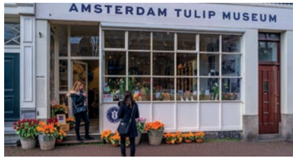
Baskets with assorted tulips adorn the entrance to the museum.