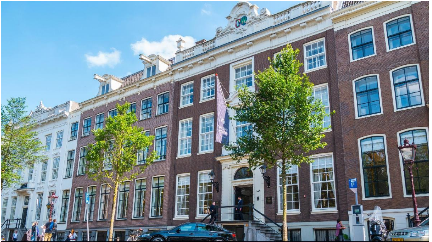
The Waldorf Astoria hotel