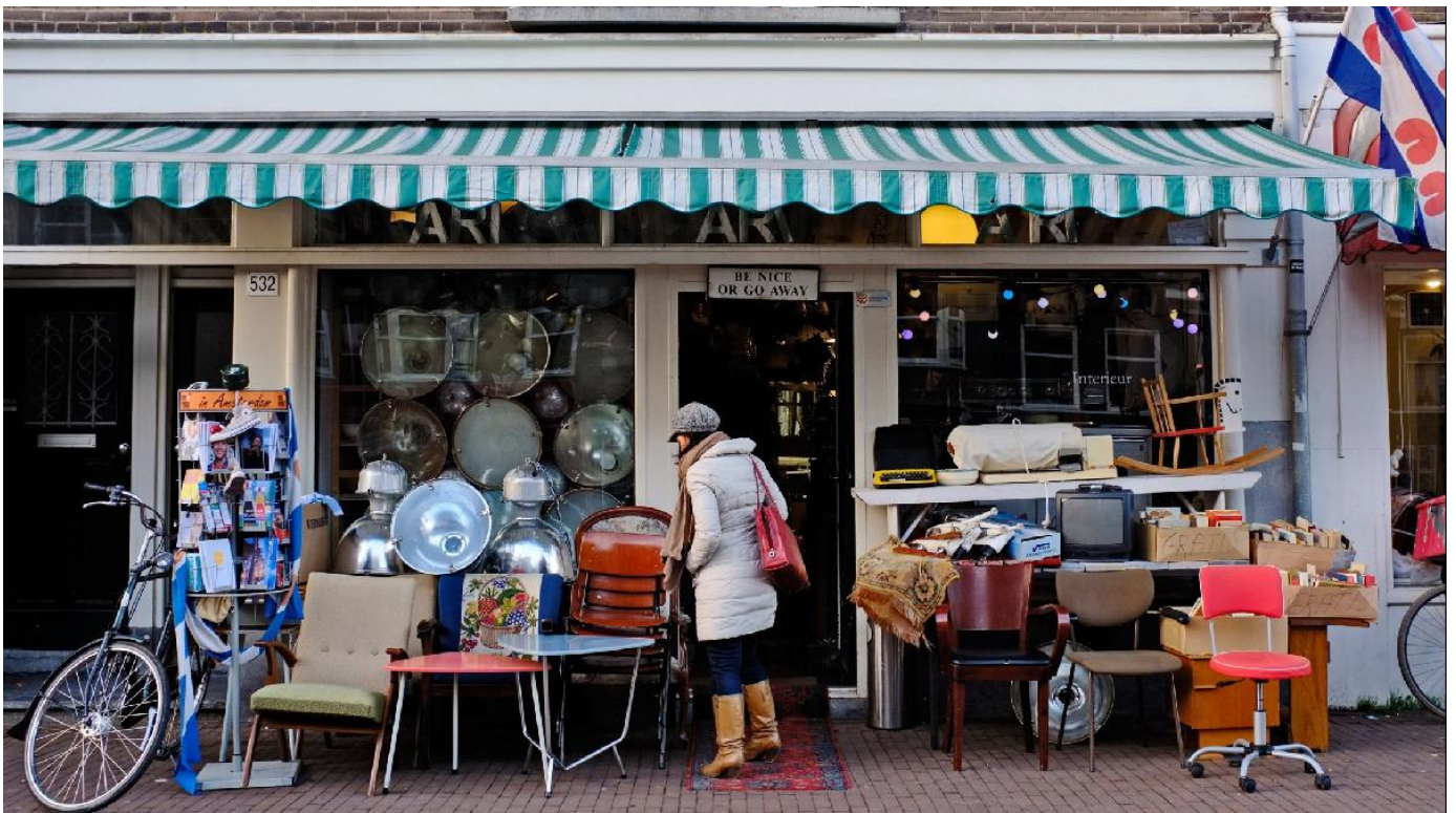
Bric a brac shop on Overtoom